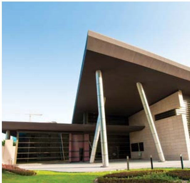
Pediatric Emergency Centre and Hemodialysis Unit at Al Khor, Medical center at the old airport, Al Ghuwairiya and Karaana, Nurses Club & Education Centre at Hamad Medical City.

ASTC has proven its credibility, particularly in its contribution to the State of Qatar's development, through the completion of projects worth QR 5 billion.