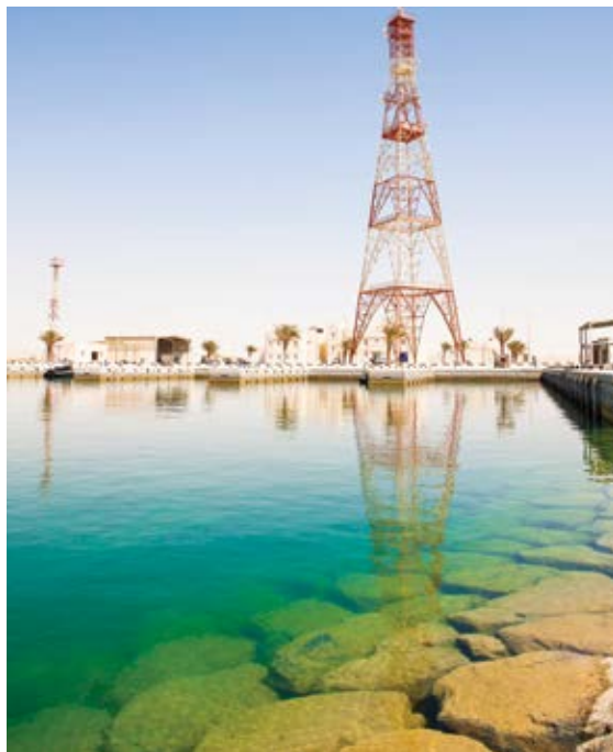
Coast Guard station and Jetty at Umm Bab.