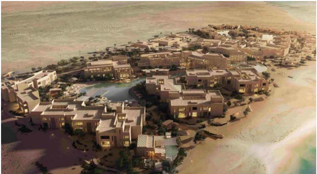
Zulal Destination Spa and Five Star Resort

taking projects which extend into the fields of engineering as well as civil and mechanical construction. Furthermore, ASTC has earned approval by the States Central Tenders Committee as a Grade A Company in building, roads and drainage works, which allow ASTC to extend its services to engineering procurements, testing and commissioning as well as startup services.